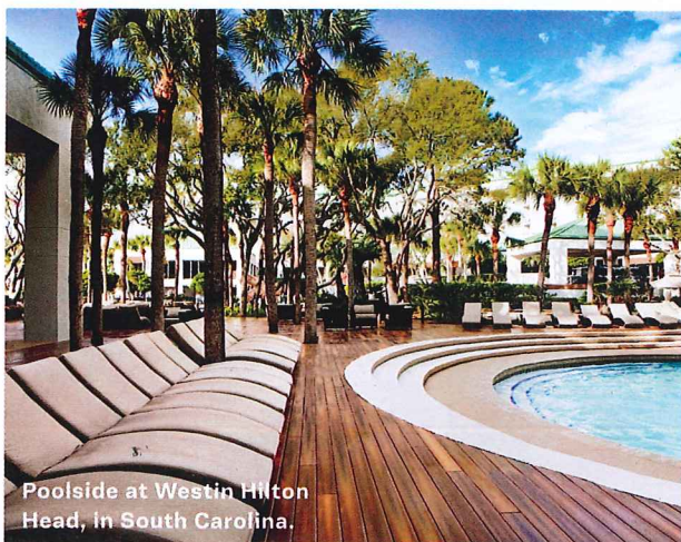
Poolside at Westin Hilton Head, in South Carolina.

WASHINGTON Dig & Dine from Iron Springs Resort ( ironspringsresort.com ), a collection of cedar cabins perched above the Washington coast. The Deal Three nights in a two-bedroom Group 1 cabin. The Highlights A guided clam dig on Copalis Beach, plus ingredients and recipes to prepare them with in your en-suite kitchen. Cost $428 ($143 per night), March 1–April 30. Savings 41 percent.