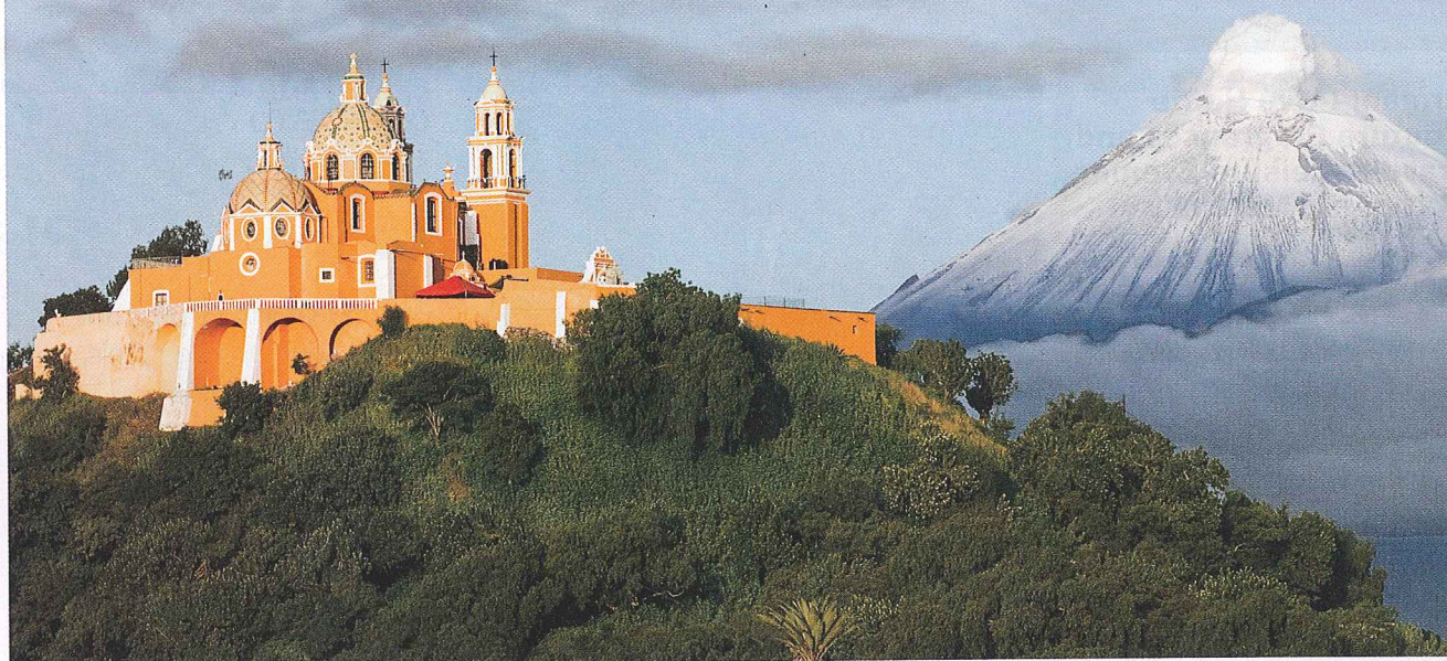
La Iglesia de los Remedios, outside Mexico City, as seen on Frui's tour of Mexico.